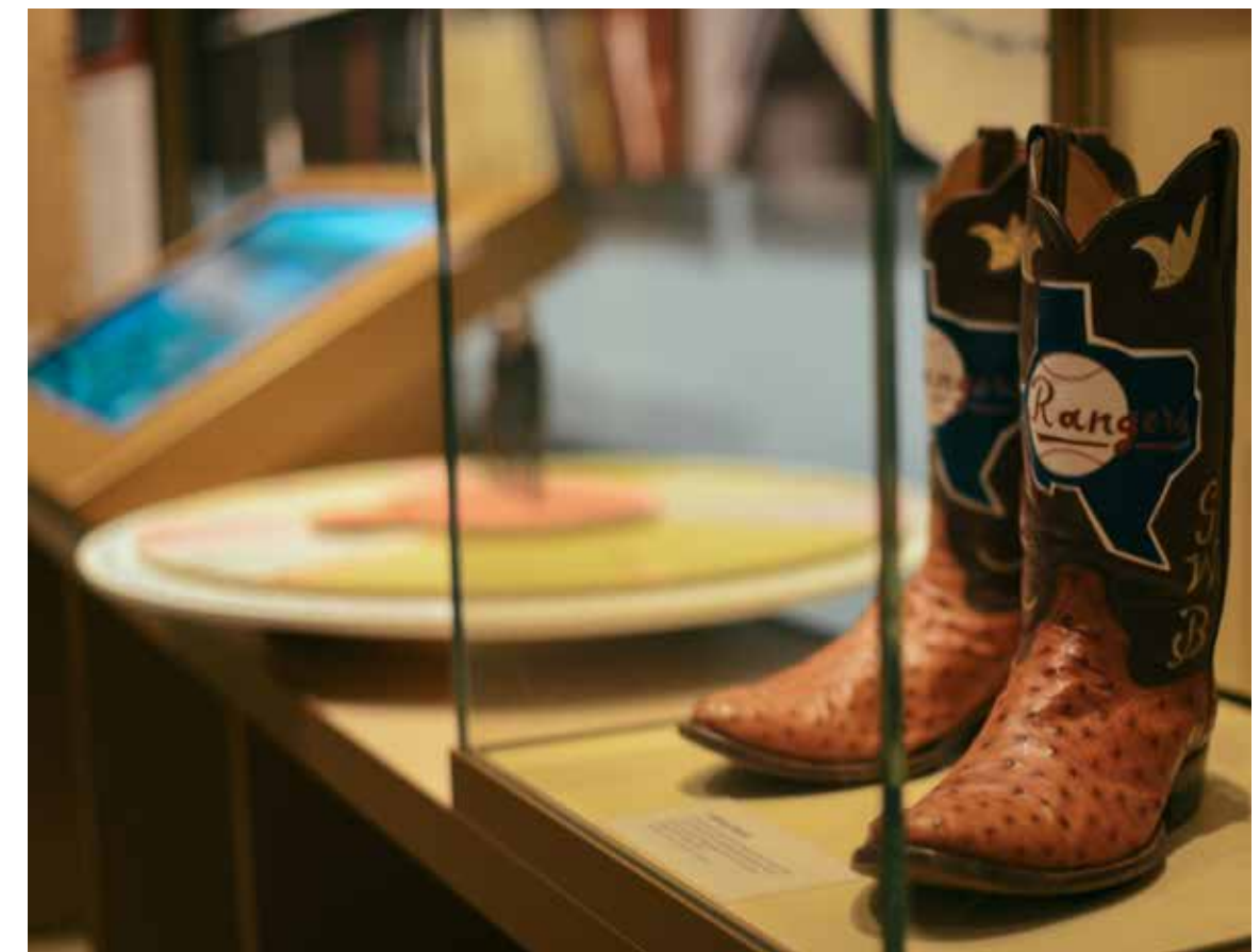
THE GEORGE W. BUSH PRESIDENTIAL LIBRARY AND MUSEUM OPENS WITH AN EXHIBIT ON THE BUSHES' EARLY LIVES IN TEXAS AND LIFE IN THE WHITE HOUSE PRE-9/11, INCLUDING TWO DOMESTIC POLICY INITIATIVES: THE TAX CUTS AND THE LANDMARK EDUCATION ACT, "NO CHILD LEFT BEHIND."