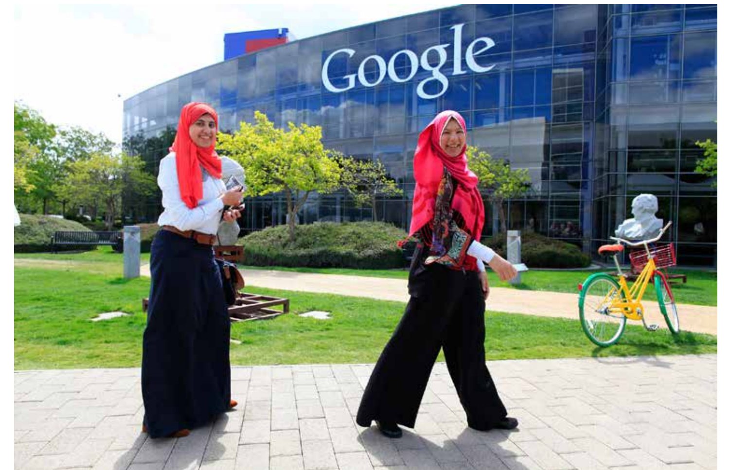
LEFT: WOMEN'S INITIATIVE FELLOWS FROM EGYPT VIEW THE PYRAMIDS ON GOOGLE EARTH DURING A VISIT TO THE GOOGLE CAMPUS IN CALIFORNIA.