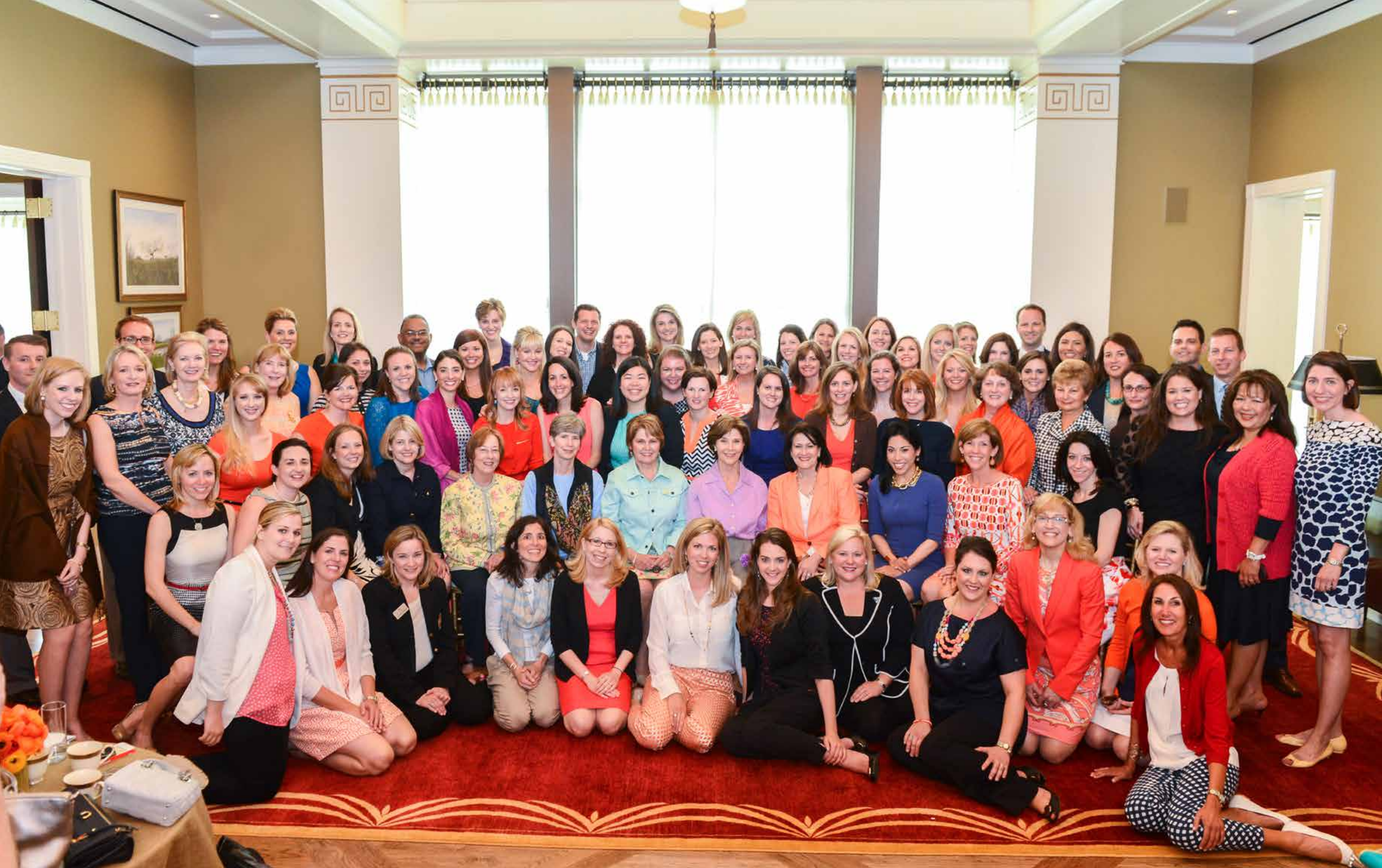
LEFT: REUNION OF FORMER EAST WING STAFF AND RESIDENCE STAFF