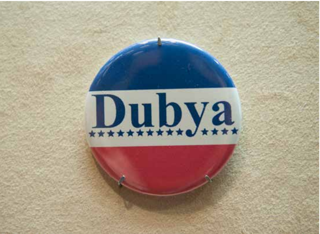
LEFT AND ABOVE: A COLLECTION OF MEMORABILIA FROM THE 2000 CAMPAIGN, INCLUDING THE CLASSIC “DUBYA” PIN