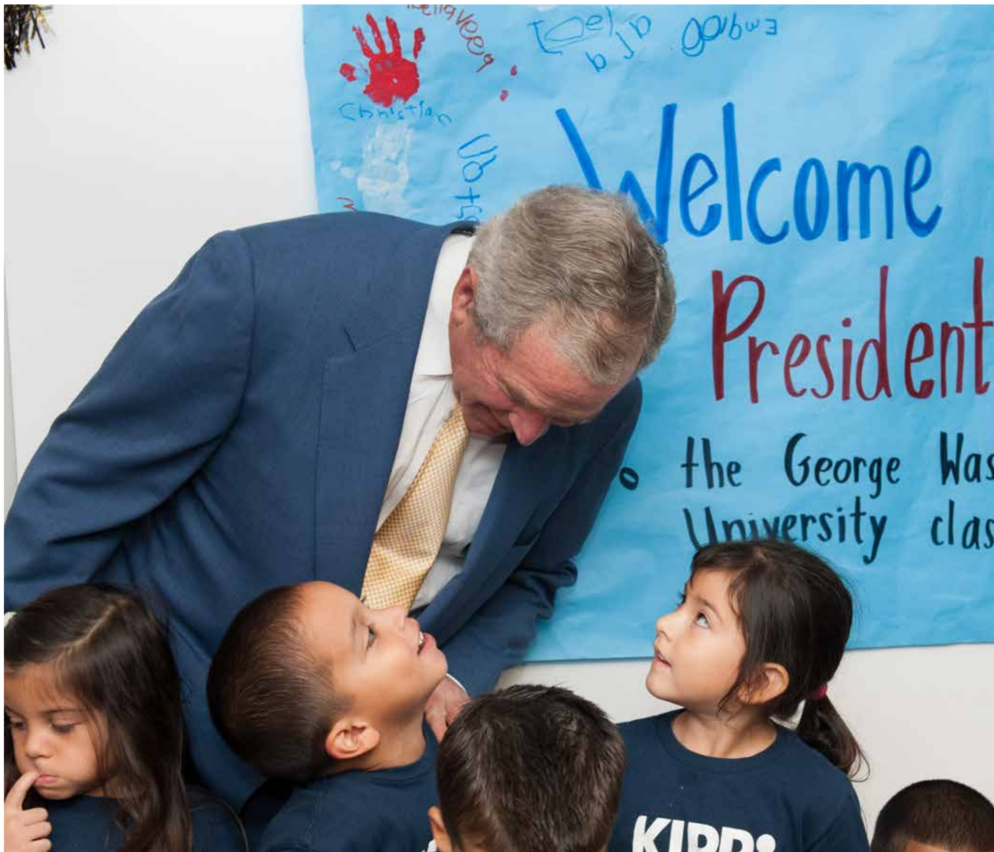
ABOVE: PRESIDENT GEORGE W. BUSH TALKS TO STUDENTS AT A KIPP CHARTER SCHOOL IN SEPTEMBER 2012. PRESIDENT BUSH TOURED BOTH THE KIPP EXPLORE AND KIPP INTREPID SCHOOLS IN HOUSTON AND DISCUSSED THE IMPORTANCE OF EDUCATION, CHARACTER AND LEADERSHIP.

In order to have a prosperous and more free America, we have to have an education system that works. The Bush Center is part of a reform movement that insists upon accountability as a key to educational excellence.